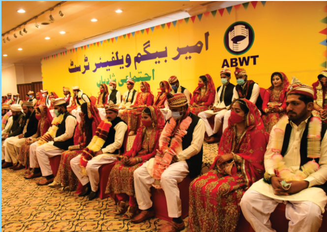
COLLECTIVE MARRIAGES CEREMONY