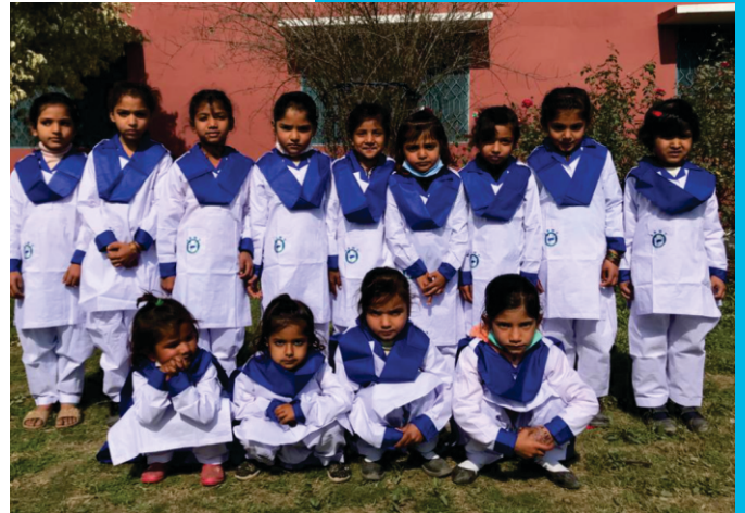
SPONSOR A SCHOOL PROGRAM